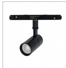
VLDN-SP50 / SP60 LED Spot LED Power: 12W/20W 760 Lm / 1355 Lm 24/36/28 Deg, 3000K D50 x H170mm