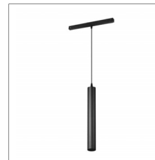
VLDN-SP60 LED Pendant Light LED Power: 13W 21 Deg, 4000K D50 x H352mm