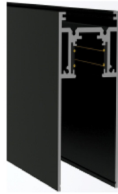
VLDN-CXS35 Surface Profile DC48V L: 2000 / 3000mm Material: Aluminum Fitting color: Black

Simple, fun & easy with magnets and LED modules. The magnetic track system is flexible, precise and let you have the choice of creating your ideal lighting systems that suits your interior designs and needs. Snap in place and connect automatically by magnets. This magnetic system is perfect for retail displays when exchanging and repositioning the lights are now quicker and easier than before.