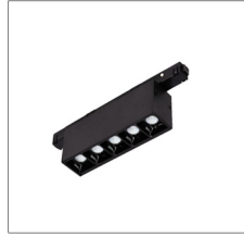
VLDN-ZS6T-10W Linear Fixed Spot LED Power: 10W 500-600 Lm 32/45 Deg, 3000K L140x W35 x H70mm