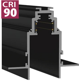
VLDN-CXR35 Recessed Profile DC48V L: 2000 / 3000mm Material: Aluminum Fitting color: Black