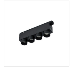
VLDN-T24T-8W-11D Linear Fixed Spot LED Power: 8W 515 Lm 11 Deg, 3000K L176 x W35 x H60mm