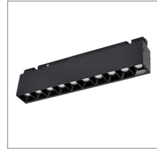
VLDN-ZS10T-20W Linear Fixed Spot LED Power: 20W 1135-1215 Lm 32/45 Deg, 3000K L270 x W35 x H70mm