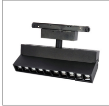
VLDN-ASP-20W Linear Adjustable Spot LED Power: 20W 1240 Lm 32 Deg, 3000K L270 x W35 x H95mm