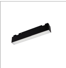
VLDN-XT300-12W Linear LED Downlight LED Power: 12W 480 Lm 3000K L300 x W35 x H75mm