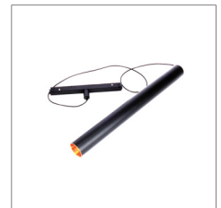
VLDN-SP40 LED Pendant Light LED Power: 6W 36Deg, 3000K D40 x H402mm