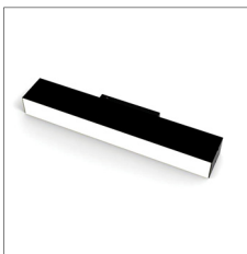
VLDN-XT600-20W Linear LED Downlight LED Power: 20W 850 Lm 3000K L600 x W35 x H75mm