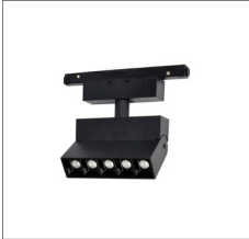
VLDN-ASP-10W Linear Adjustable Spot LED Power: 10W 610 Lm 32 Deg, 3000K L138 x W35 x H95mm