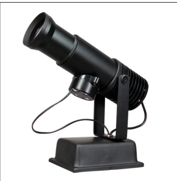
VLE-3166-R (Rotating Logo Projector)