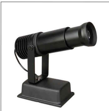
VLE-3166-S (Still Logo Projector)