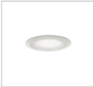
Off-white (matt finish)