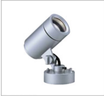
Silver (metallic finish)