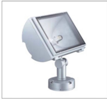
Silver (metallic finish)