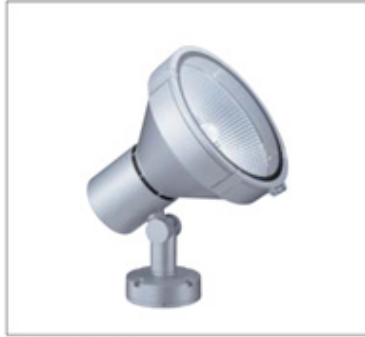
Silver (metallic finish)