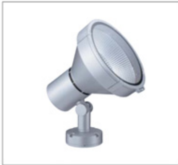
Silver (metallic finish)